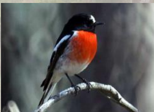
Scarlet Robin

The Friends of the Pinnacle (fotpin) is a local community-based group of park care volunteers who work closely with the ACT Parks and Conservation Service to conserve and restore the ecological values of the reserve. Through a program of weeding, erosion control, targeted plantings and community activities, our aim is to protect areas of high conservation value and restore native vegetation to degraded areas. The fotpins are a growing and enthusiastic group committed to preserving and enhancing this wonderful patch of bush.