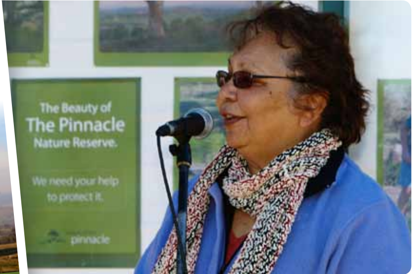
Matilda House welcoming us to Country