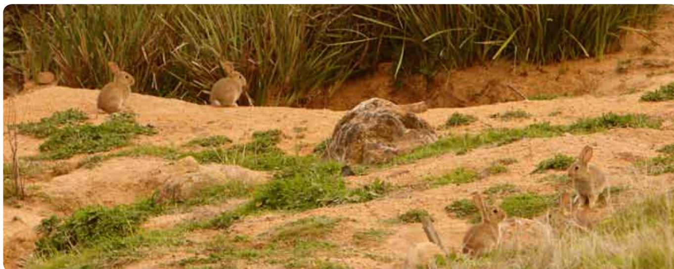
Rabbits numbers at The Pinnacle are unsustainable