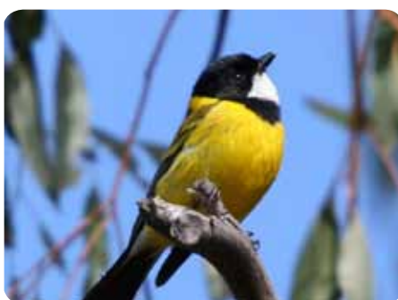
Golden Whistler