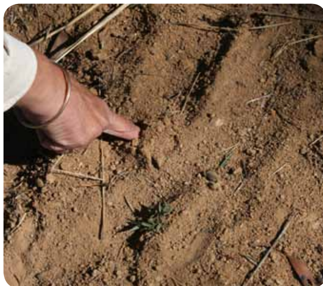
Kangaroo physical disturbance has released 20 mm of soil into easily eroded particles