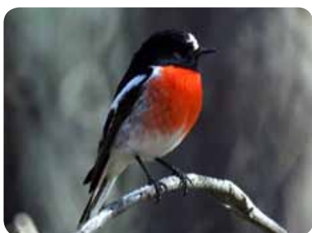
Scarlet Robin