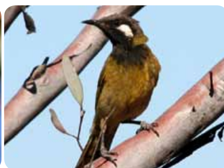
White-eared Honeyeater